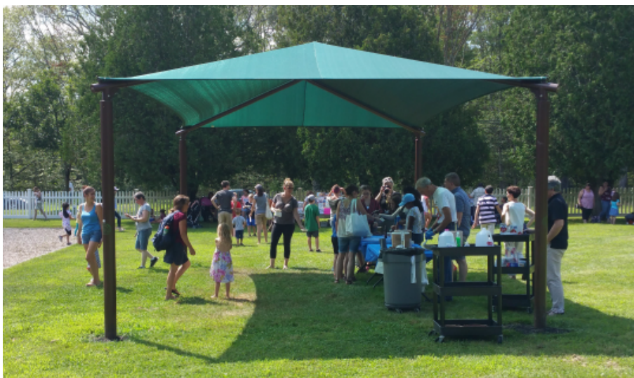
The annual ice cream social is a favorite event at the library. Ice cream with all the fixings, outdoor games, free books for kids - all supported by the Friends of the library.